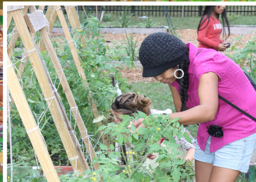
Community members & their families harvest vegetables from the garden to take home.