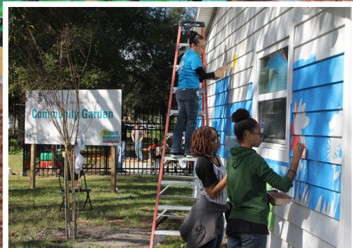
Prodigy staff members and volunteers paint a mural on the side of the Harvest Hope Center.

Implemented in 2015, UACDC'S Get Moving! program promotes health and wellness in the University area and surrounding areas by offering an array of healthy activities, including: