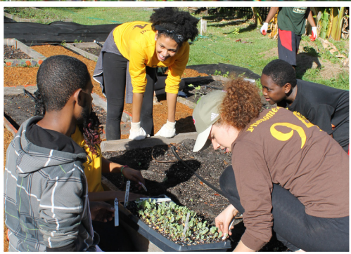
Volunteers during the annual Paint the Town event work together to plant seedlings in garden beds.