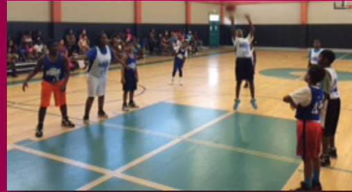
Local youth compete in the Youth Basketball League tournament.