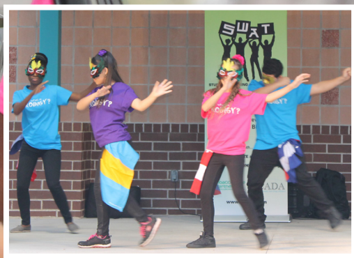
Prodigy® Youth performing at "I am Prodigy" Music Fest