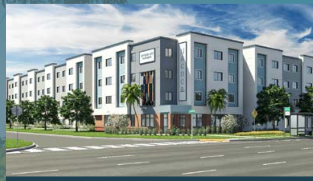
Uptown Sky Multi-Family Housing: 12th St. & Fletcher Ave., Tampa FL 33613

ATTAINABLE HOUSING & LAND BANKING : Attainable housing is a key priority in University Area CDC's Neighborhood Transformation Strategy, and it all began with land acquisition through our land banking program. In 2020, we secured funding to advance plans for four major developments in our attainable housing efforts; the beginning of which, a Cultural Campus adjacent to our Harvest Hope Park, broke ground in February of 2021. On these exciting efforts we're showcasing the